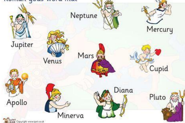
Roman gods word mat

Learn about 10 of the major gods here . Read through the slides up to page 23 to see what each god has control over. Optional - If you want to read on about some of the other gods then go ahead!