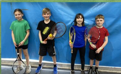
Congratulations to the tennis team!