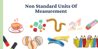
Non Standard Units Of Measurement

Practise your 2's, 5's and 10's times tables.