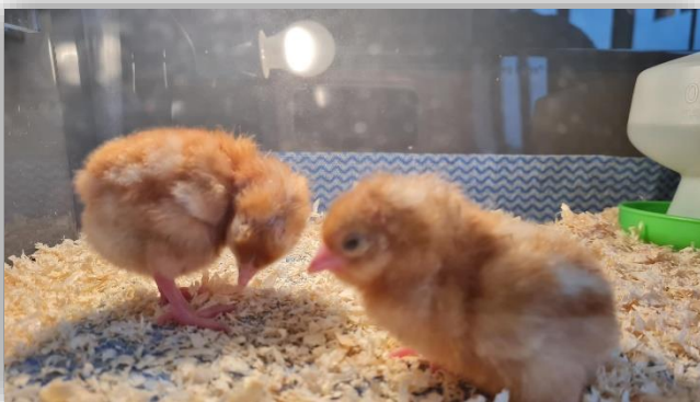
Just two of the nine chicks that hatched in Year two...and a visit from the Animal man in Year one